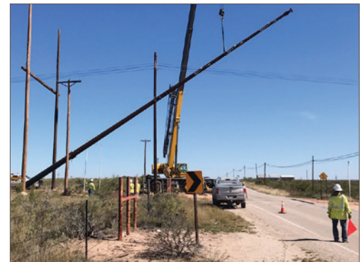
A steel structure is set on the Monument Tap-Byrd Tap 115 kV project which was energized in November. The project will improve electric reliability and meet growing demand in New Mexico.