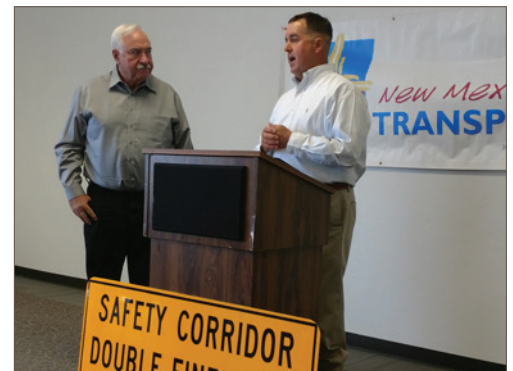
Safety is a top priority for our employees, contractors and customers. Earlier this year, we partnered with local leaders, including the New Mexico Department of Transportation, to recognize improvements on local highways that have seen an increase in traffic due to industrial growth.