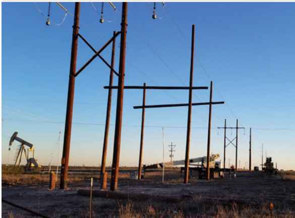
Crews work on stringing conductor for the Monument Tap-Byrd Tap 115 kV transmission line west of Hobbs, N.M.